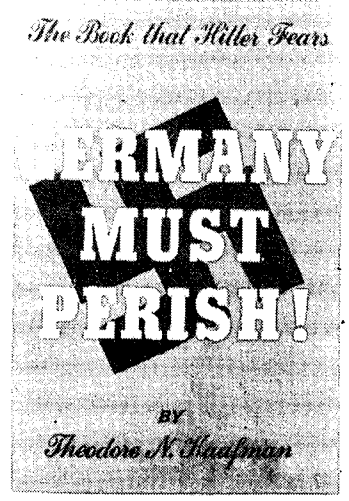
ORDER No.: 7012 - $4.00